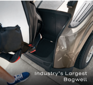
Industry's Largest Bagwell